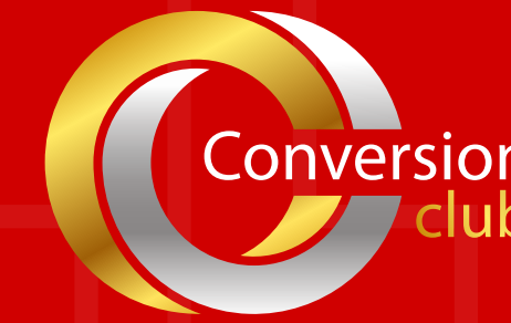
TABLE TENT SPONSOR USD 4000